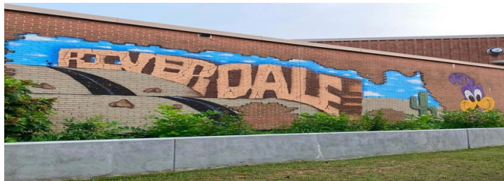
Example of a mural recently commissioned by the Town of Riverdale Park.

"Art is too important not to share." -Romero Britto